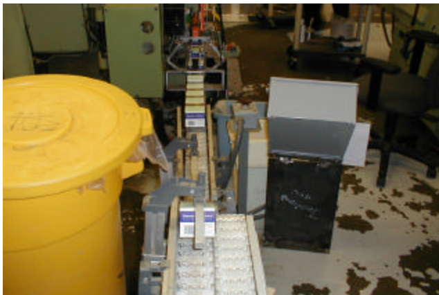
The vertical capabilities of FlexLink allows Traditional Medicinals to accommodate the varying heights required in their manufacturing process.

Because Traditional Medicinals understood the true flexibility of FlexLink, they designed, built and implemented an electrical and control system that is as modular as FlexLink. Traditional Medicinals went with an IDEC PLC to handle the interfaces between the conveyors and manufacturing equipment. "My idea behind the control and electrical system", according to Alvin, "was to keep it simple, reliable and modular. As Traditional Medicinals grows, the manufacturing equipment needs to be brought on-line easily and quickly."