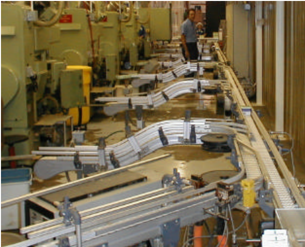
XM Incline conveyors delivering tea boxes to on-the-fly box gluing and check weighing machines.

As Traditional Medicinals has grown, they have had to change the layout and flow 6 different times. With each change, FlexLink was able to meet the challenges.